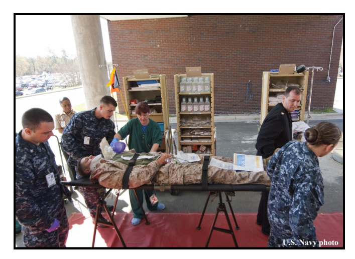
A Naval Hospital Camp Lejeune triage team evaluates a simulated Marine casualty during Operation Urgent Response, an all-hazards, full-scale exercise between MCB Lejeune, MCAS New River and NHCL on March 24.

In the Sandy Run training area of Marine Corps Base Camp Lejeune, a large wild fire ignited, obliging MCB officials to request that NHCL man the MCB Emergency Operations Center with a medical liaison. With the drill in high gear, uninterrupted, NHCL's incident commander continued the drill operations, while NHCL's emergency manager provided support to the real-life code. Both operations continued without a hitch.